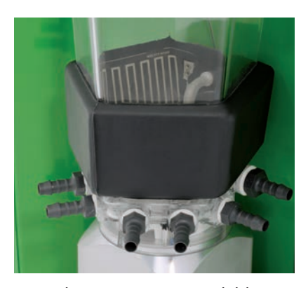
Mixer heating system available as an accessory

The automatic lamb feeder can be easily and intuitively operated thanks to its compact control unit and the 7-segment display. With the clearly laid out function menu, the water and MP portion size can be configured separately with the direct select buttons. A portion counter allows you to easily monitor the amount of feed that has been dispensed.