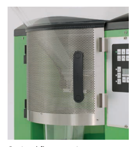
Optional fly protection screen

The fine-pored fly screen for the mixer prevents flies from getting into the feeding box. Steam that arises in the feeding box can easily escape because of the large size of the box and through the pores; condensation water is easily prevented this way.